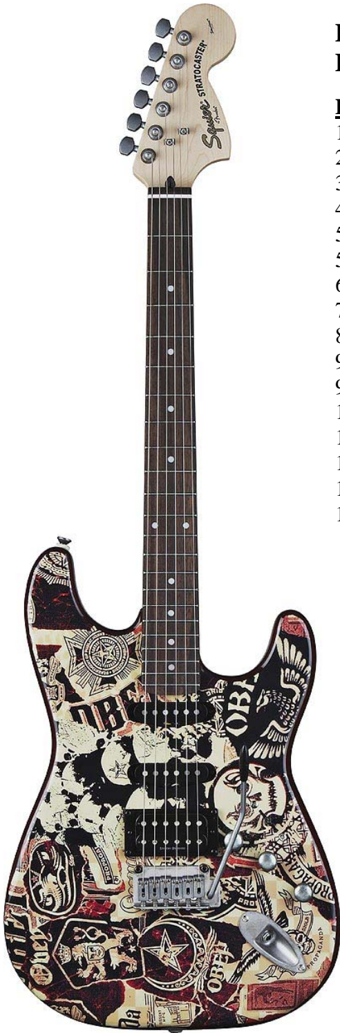
Obey "Graphic" Model